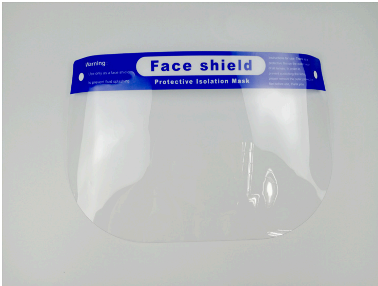
Part number C0804003

Our face shield personal protective equipment (PPE) is the product of choice by healthcare and industry professionals worldwide. It is designed for the protection of the user's face from hazards such as splashes (e.g. chemical liquids), flying objects (e.g. small debris) as well as to control and minimize infections (i.e. protection from sneezing). The face shield is convenient to use, comfortable to wear, durable, made with safe materials and offers an exceptional product quality.